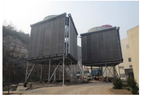
ENEXIO Delta Cell means extra space