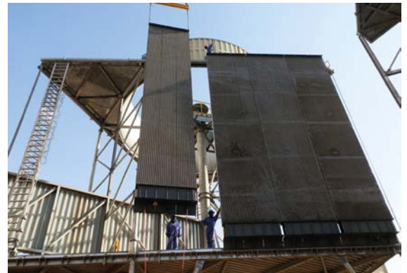
Easy tube bundle erection