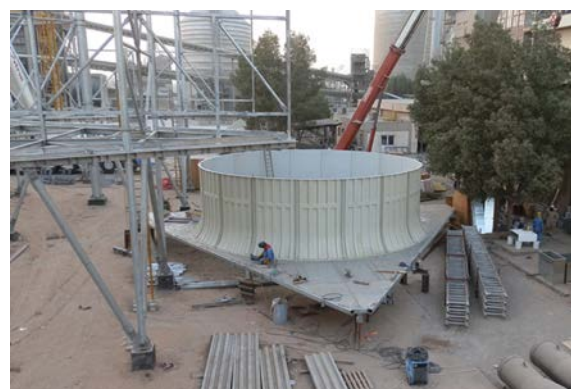
Preassembling on ground level